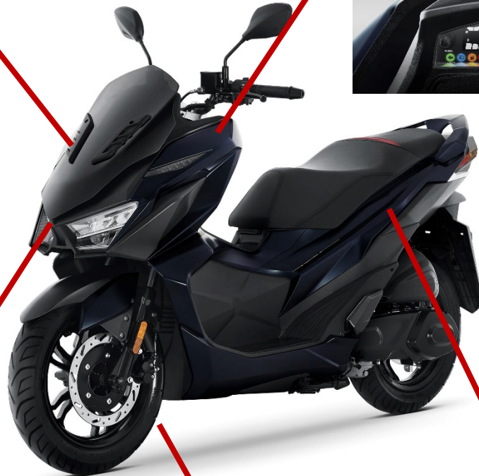
Tableau de bord LCD